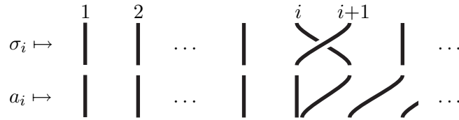
FIGURE 1. Diagram representation of the generators of B_\bullet : there are infinitely strands numbered by positive integer coefficients polynomials in an infinitely small variable \epsilon ; the effect of \sigma_i is to let all strands with index i + 1 + o(1) cross over all strands with index i + o(1) ; the effect of a_i is to shrink all strands of the form i + o(1) by a factor \epsilon and to left translate all strands with index \geq i + 1 so as to avoid gaps.

It is shown in [3] that B_\bullet is actually generated by \sigma_1, \sigma_2, a_1 , and a_2 , and that it admits a finite—but much less readable—presentation with respect to those generators. It is shown in [6] that the elements of B_\bullet admit a natural geometric interpretation in terms of parenthesized braid diagrams, which are similar to ordinary braid diagrams— cf. for instance [1, 4, 14]—but with non-uniform distances between the strands. As we shall use this interpretation here—nor do we either use the interpretation in terms of isotopy classes of homeomorphisms of a sphere with a Cantor set of punctures—we shall not go into details here and just refer to Figure 1 for a rough intuition.