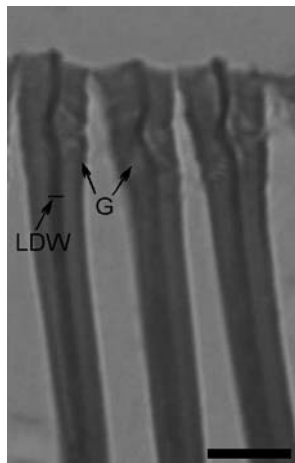
Fig. 3: Longitudinal section of poplar tension wood fibres showing an increase in the G-layer thickness near the cutting surface. LDW = Lignified Double wall ( S_2+S_1+P +intercellular layer+ P+S_1+S_2 ), G = G-layer. Scale bar = 10 μm.