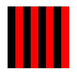
Figure 2: The multilayer case