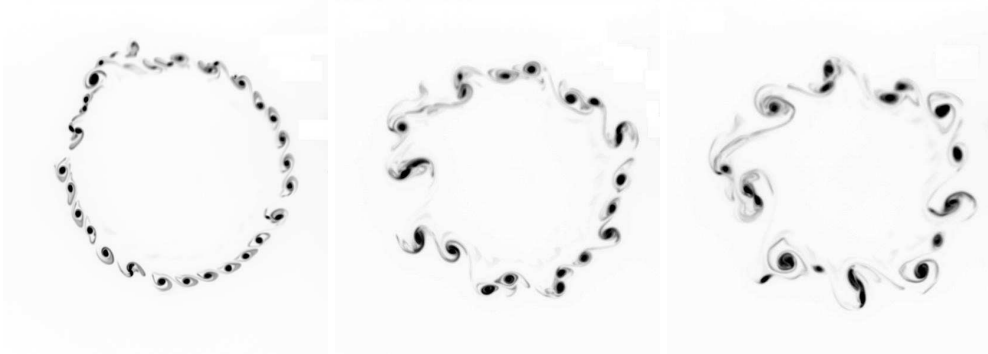
FIG. 2: Evolution of an electron beam in ELTRAP in the space charge regime. The images have been taken using different values of the confining magnetic field (decreasing from left to the right picture)

by measuring the electron density on the phosphor screen at different B values. A "time evolution" can be then obtained by slowly decreasing the magnetic field. The observed density evolution on the phosphor screen is described by a purely 2D dynamics as far as the mentioned approximations are valid. Three images representing the density distribution of a beam on the phosphor screen at different times, obtained by decreasing B , are shown in Fig. 2.