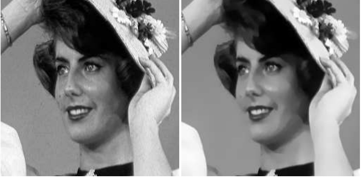
Figure 2: RIGHT : Original natural image. LEFT: The output of our scheme at scale 5.