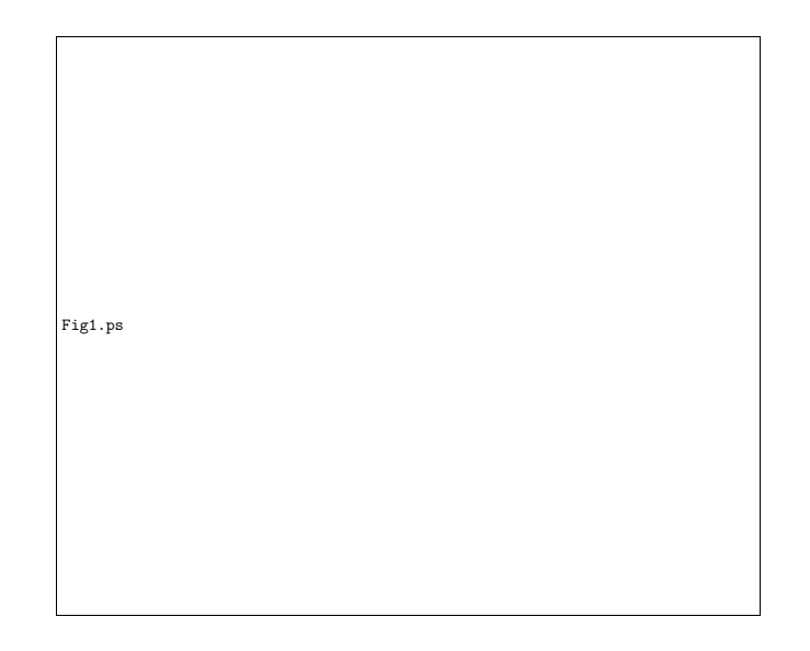
FIG. 1: SBS reflectivity R_{\text{SBS}} versus time for the case of an undamped IAW with the parameters I_L = 2.5 \cdot 10^{14} \text{W/cm}^2 for \lambda_0 = 1.064 \mu \text{m} at T_e = 1 \text{keV} , N_0/n_c = 0.1 (taken at center), 2k_0\lambda_D = 0.27 , L_{\text{ini}} \simeq 160\lambda_0 . The solid line is obtained from the decomposition code considering all terms, the dashed line from the decomposition code disregarding higher IAW harmonics, and the dash-dotted line from the "full" code.