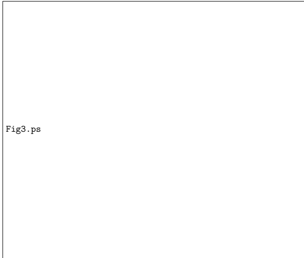
FIG. 3: Spectrum of the backscattered light, corresponding to Fig. 1. The frequency is shifted with respect to the incident laser frequency \omega_0 .

including additional mechanisms such as kinetic effects via an amplitude-dependent nonlinear frequency shift. We currently work on a generalization of the harmonic decomposition method in order to include the subharmonic IAW decay.