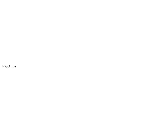
FIG. 1: SBS reflectivity R_{\text{SBS}} versus time for the case of an undamped IAW with the parameters I_L = 2.5 \cdot 10^{14} \text{W/cm}^2 for \lambda_0 = 1.064 \mu\text{m} at T_e = 1 \text{keV} , N_0/n_c = 0.1 (taken at center), 2k_0\lambda_D = 0.27 , L_{\text{ini}} \simeq 160\lambda_0 . The solid line is obtained from the decomposition code considering all terms, the dashed line from the decomposition code disregarding higher IAW harmonics, and the dash-dotted line from the "full" code.

We have performed simulations on the basis of equations (1)-(5) and expanded the IAW up to its 3rd harmonic, resulting in a set of equations for n_1 , n_2 , and n_3 , with the rhs terms Q_1 = n_2 n_1^* + n_3 n_2^* , Q_2 = n_1^2 + 2n_3 n_1^* , and Q_3 = 3n_2 n_1 . We did not observe any significant changes when harmonics above the 3rd order were retained, while restricting to less than 3 harmonics led to important differences. At this stage of our study we restricted ourselves to one-dimensional (1D) simulations in order to benchmark our harmonic decomposition code against a "complete" 1D code which does not make the decomposition corresponding to Eqs. (1)-(3). This latter code solves Helmholtz's equation for the total electric field E(z, t) on the first hand, and the system of fluid equations for continuity and momentum, with the complete ponderomotive force, \nabla |E(z, t)|^2 , as a source term, on the second hand. Here, in 1D, the operator \nabla reduces to the partial derivative \mathbf{e}_z \partial_z .