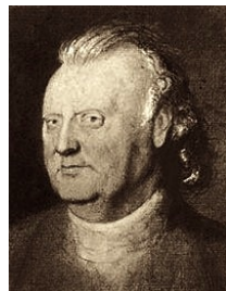
E. Waring (1736-1798)

Tensors have been introduced at the end of the nineteenth century with the development of the differential calculus. They have then been omnipresent in physics, to express laws independently of coordinate systems. Yet, a tensor is essentially a mapping from a linear space to another, whose coordinates transform multilinearly under a change of bases, as subsequently detailed. For an easier reading, we shall resort to arrays of coordinates, when this indeed eases presentation; interested readers may want to refer to [23], [49] for a more advanced coordinate-free presentation.