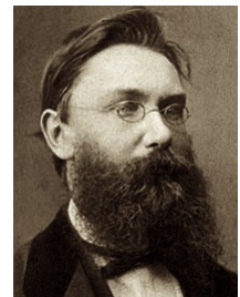
A. Clebsch (1833-1872)