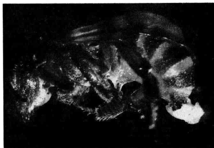
Fig 2. Adult worker emerged from diflubenzuron treated pupa with a lump of white tissue at the abdominal end.

In pupae of A mellifera treated with 6 \mu\text{g} DF per pupa adult emergence was 13%, with 9% workers showing morphological defects. Treatment with 4 \mu\text{g} DF produced 33% worker bees, of which 5% had morphological abnormalities. In these bees, a white lump of unrecognisable identity was detected entangled with the stylet and lancets of the sting apparatus (fig 2). This may have been the evaginated reproductive system or shed cuticle from the integument or the hindgut of the pupa. However, apart from the stylet and the lancets which were not properly interlocked, the sting apparatus appeared normal. In pupae of A c indica treated with 4 \mu\text{g} DF each, adult