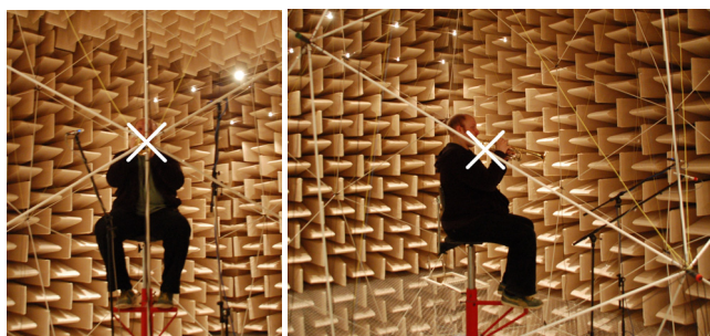
Figure 1: Perspective photos of the recording with geometric center of the spherical array marked with a white cross, cf. [14]

In Figure 1 the placement of the musician is depicted with perspective photographs for the case of the trumpet. A white cross marks the axis of the geometrical center of the array from two directions. It can be seen that the expected sound source can be assumed to be located further to the front than the marks suggest.