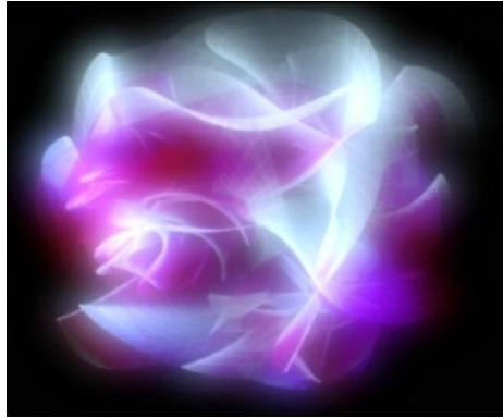
FIGURE 2 – Une variété de Calabi Yau

For n = 3 , we have the three points correlation function or "pant" : n = 3 , \langle [H], [H], [H] \rangle_\beta , basic "lego" of topological fields theory .