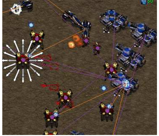
Fig. 3. Screen capture of a fight in which our bot controls the bottom-left units in StarCraft. The 24 possible directions are represented for a unit with white and grey arrows.

StarCraft is a canonical RTS game, as Chess is to board games, because it had been around since 1998, it sold 10 millions licenses and was the best competitive RTS. There are numerous international competitions (World Cyber Games, Electronic Sports World Cup, BlizzCon, IeSF Invitational,