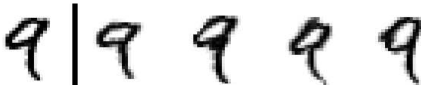
Fig. 2. Samples generated by elastic distortion from the original pattern shown on the left.

of the training set to generate 9 new samples for each one, thus multiplying the size of the training set by 10. Figure 2 shows some samples generated by elastic distortion.