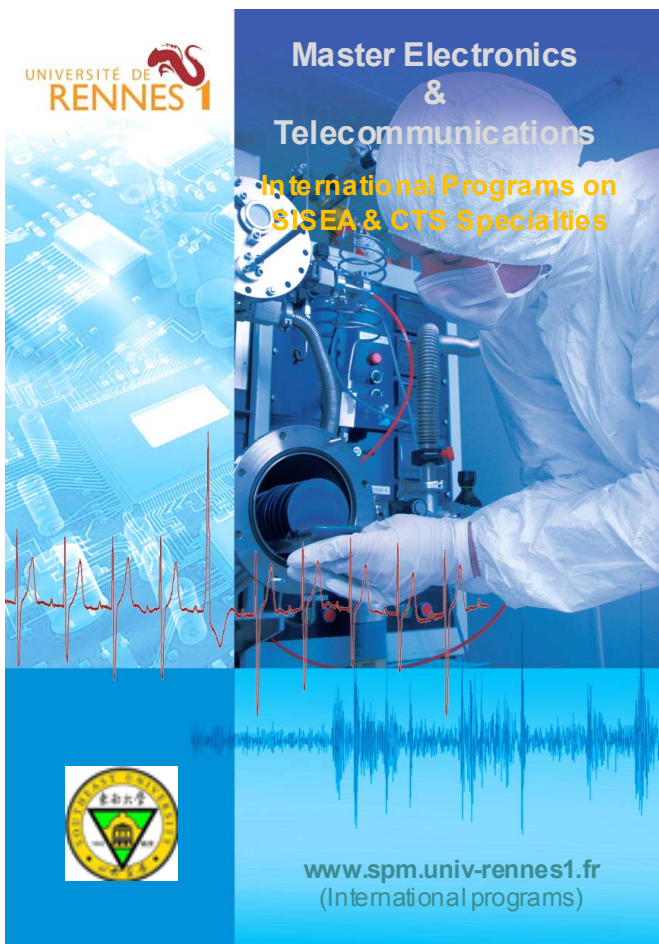
Figure 2. Figure 1. Figure 2. Booklet of presentation of the international program of the master built by SEU and URI

The authors are very indebted to President H. Yi of the SouthEast University and to President G. Cathelineau and to