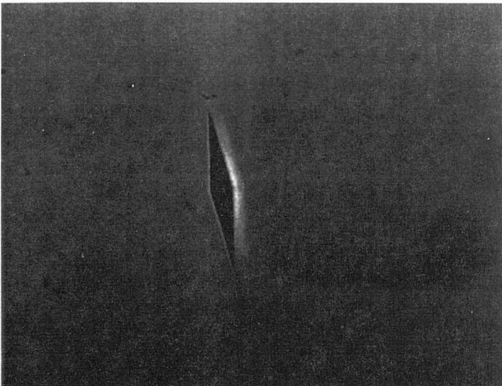
Figure 2. Knoop indentation into Zr metallic glass 200 gm load 500X magnification.