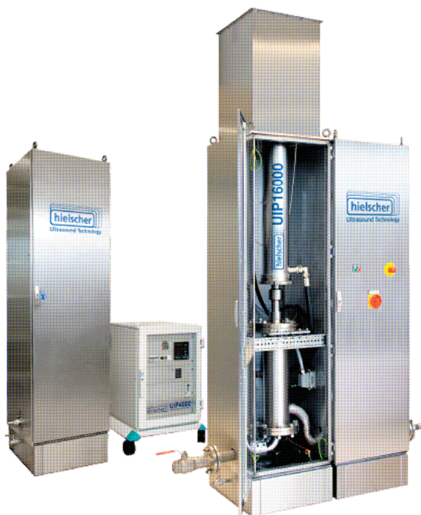
Picture 4 - Commercial 4,000 Watts (left) and 16,000 Watts (right) System for Inline Operation

Based upon the optimal parameter configuration found during optimization and the related energy/volume required the power capacity required for scale up can be calculated. The parameter configuration of the final system is to be identical to the optimal configuration. Commercial systems of up to 16,000 watts per single device are available. Such systems can be widely adapted to amplitude and pressure requirements in order to perform at the optimal efficiency. Picture 4 shows a complete 16,000 watts with generator, transducer, sonotrode and flow cell. For larger industrial setups, several such units can be used in parallel or in series. Such clusters are almost unlimited in total power. As the adaptation of such ultrasonic units is mostly limited to boosters, sonotrodes and flow cells, it is mostly possible to re-adapt the units to new parameter configurations if necessary. This may be required, if the product formulation or the required result changes.