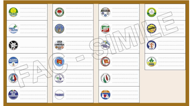
Figure 1. Facsimile of a paper ballot for European elections used in Italy

To give an idea of what a paper ballot looked like in the Italian elections, I present in figure 1 an actual ballot still used for the European elections today. The voter chooses a party by drawing a cross on the party's symbol, and may optionally express a number of ranked preferences by writing down candidate names on the lines on the right of the party's symbol. In the current European election method the number of these preferences is limited to three; in the Italian parliamentary elections in the 80's the voter could express up to 4 preferences and lists with over 40 candidates were commonplace.