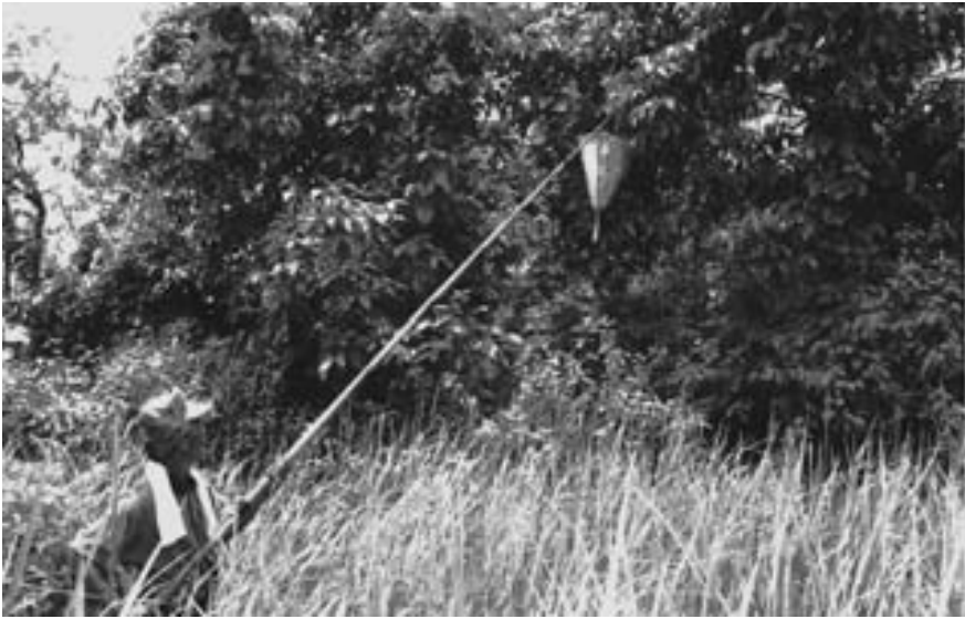
Photo 1. Kroto is collected with a long bamboo stick to reach the nest in the trees

and during the rest of the day while the collector is working other sites. Adult ants, larvae and various organic fragments fall from the bag during the harvest and during the trip from the one site to another. The insects in particular will continue to escape from the bag during the trip, leaving behind most of their larvae. At the end of the day the collector will remove another 20% of the initial weight in the form of debris. After having quickly removed the undesirable debris, collectors transfer the contents of their bags to a container or appropriate box, eventually cleaning the bag of the last ants using a synthetic feather duster ( kemoceng ). Twigs and small leaves, but also dead insects or their remains, are graded and separated from the larvae.