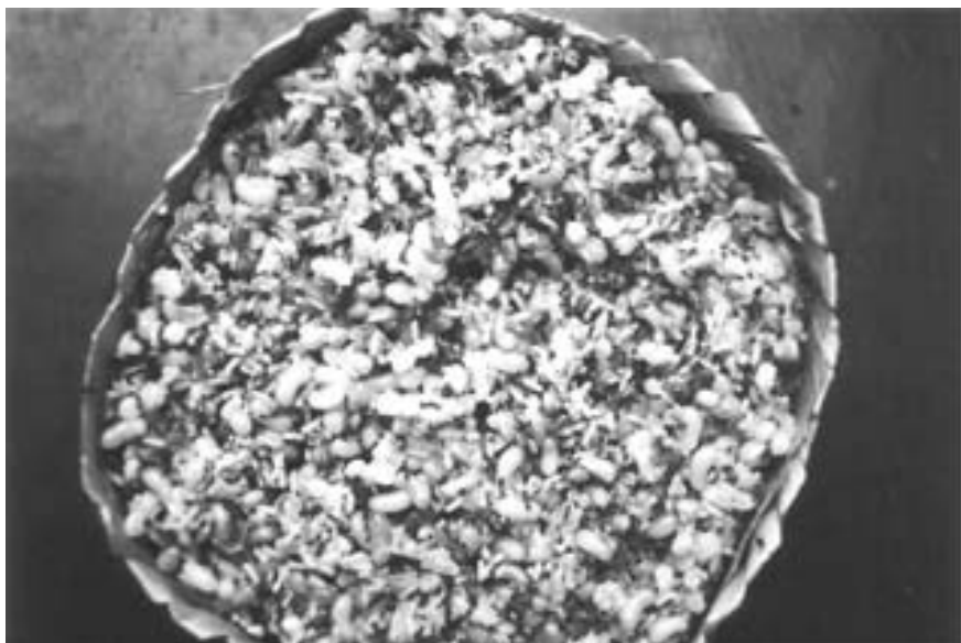
Photo 2. A besek of ant larvae equals 1 kg of ‘wet’ quality kroto

of the quick deterioration of kroto it is again subjected to grading in Jakarta. More than 10% of the produce may have to be thrown out. From experience collectors know that weaver ants produce fewer larvae during the hottest months of the year, but that the nests contain the biggest larvae (sexed larvae). This kroto can be kept longer than the kroto composed of smaller larvae.