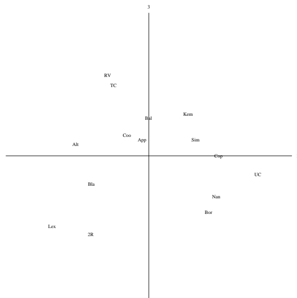
Fig. 2 Axes 1 and 3