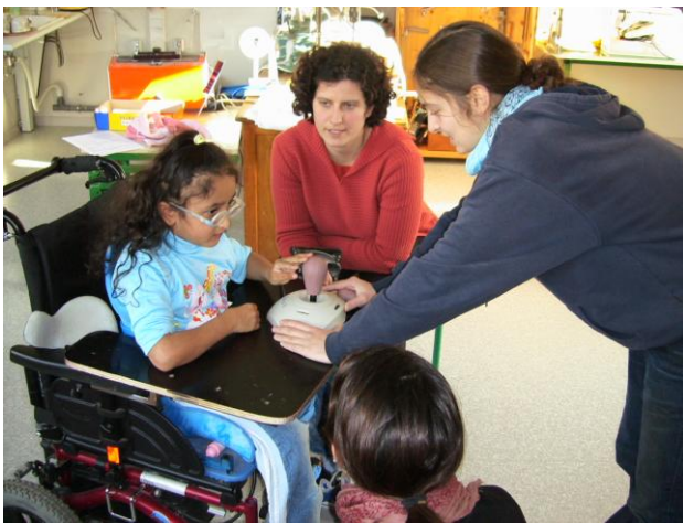
Figure 1 – AE2M Project; students evaluating their designed prototype by the usage of their handicapped user.

In one of the institutes specifically for handicapped children in Grenoble, France, a music teacher observed that some children had a significant response to music, and were even motivated to play. But, because of their physical limitations, these children could not use the typical instruments. This context inspired the idea for the AE2M project for engineering students ( http://projetae2m.free.fr/ ) in which the goal was to develop practical solutions for to enable handicapped children to play common instruments. The project started three years ago and each year, groups of students start to work on new cases.