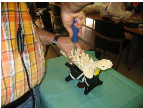
Fig. 5. Preliminary placement of three screws in vertebral pedicles by the surgeon

To recover a maximum of information at the end of this experiment, instructions were clearly notified to the surgeon. Frontal and general video cameras and a micro tie were installed to clearly observe the user and record its remarks.