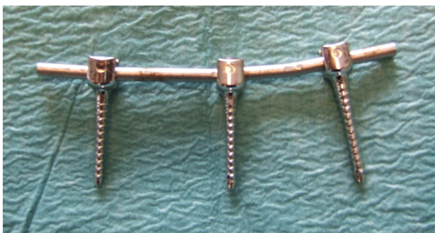
Fig. 3. Picture of on part of the current implant placed on the lumbar vertebra of the patient

Currently, implant represented in figure 3 is set up through a 25cm large incision. That is why the main stem can be "easily" inserted in the three screw heads.