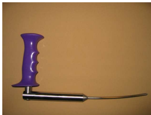
Fig. 4. Picture of the first surgical tool prototype

The difficulty resides in the fact that there is no visibility inside the human body during all this new established operative procedure. The precise placement of the holes (located compared to the vertebrae) depends of the knowledge and the experience of the surgeon. The delicate insertion of the screws through the skin, muscles and grease, without damages caused to the patient, requires the design of complementary surgical tools.