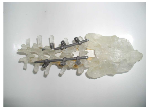
Fig. 2. Picture of the implant placed on the lumbar vertebra of the patient

Following this observation, the surgeon has explained his need concerning the use of minimally invasive surgical tools.