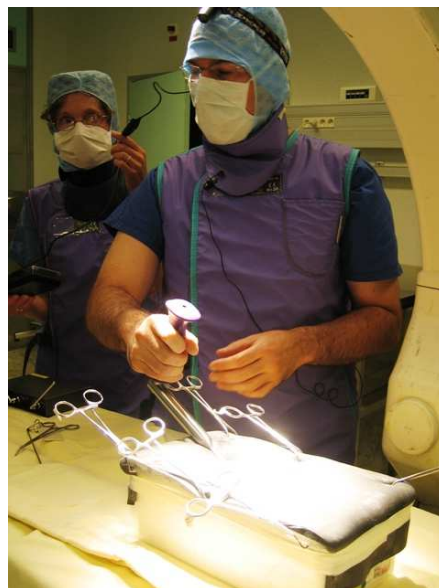
Fig. 6. Surgeon manipulates the prototype during the scenario

Thanks to the information collection equipment installed in the operating room, a large part of the work consists in organising and analyzing the recovered data. Several improvements were considered, mainly starting from the films and the speech recorded during the scenario.