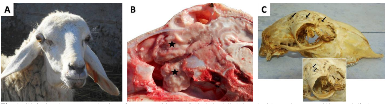
Fig. 1. Clinical and gross examination of one-year-old ewe of "Ouled Djellal" breed with nasal tumour. (A): Nasal discharge, exophthalmia, deformation of the frontal bone and facial asymmetry. (B): Sagittal section of the head with tumoral masses (★). (C): Softening and perforation of the frontal, lacrimal and ethmoidal bones (✔).