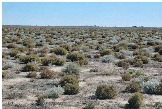
Figure 2. Southern Riverina, Australia. Left: weeping myall Acacia pendula woodland and right, transformation to chenopod shrubland after land clearing, dryland salinity and repeated, severe droughts. The shrubland now supports a highly drought-resistant grazing system for saltbush sheep.