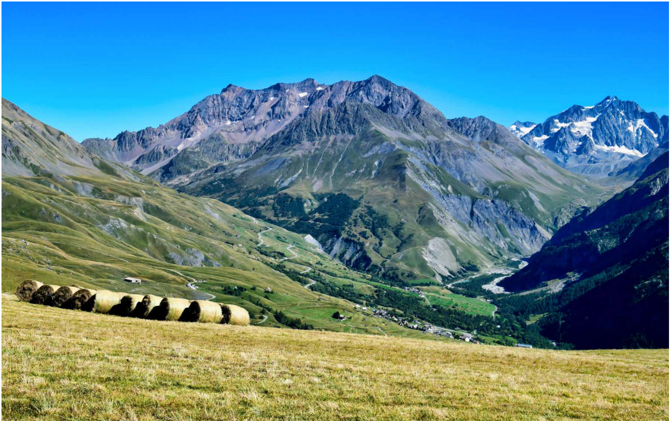
Figure 1. Lautaret study site (photo by Bruno Locatelli).

The traditional and multifunctional landscape management of terrace cultivation, fertilization, mowing and summer grazing has shaped the function of ecosystems and their services in Lautaret. Stakeholders identify and value several grassland ecosystem services such as fodder production, regulation of soil fertility and stability, water quality regulation, and cultural heritage and scenic beauty. These services also have benefits for adaptation. As climate variability and drought risk increase, landscape and grassland management support erosion control and the resilience of fodder production. Diversification of farmer income with additional marketable products and nature tourism, based on the conservation of plant and animal biodiversity, is also supported.