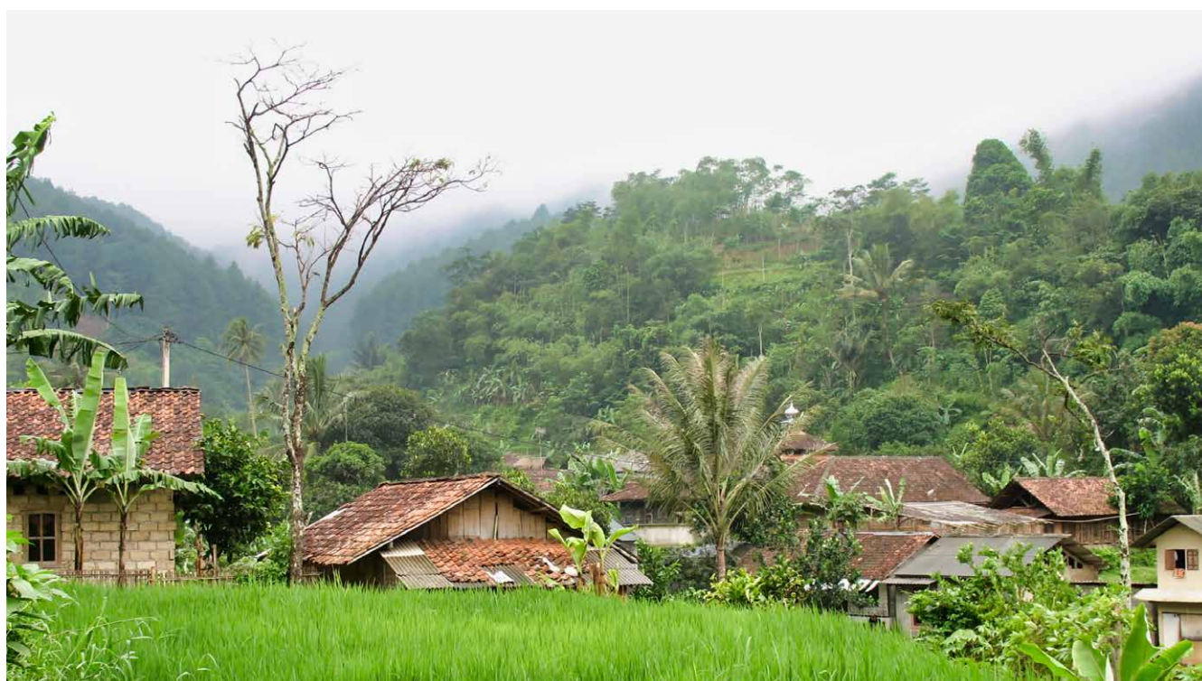
Figure 5. Rural landscape in Java, Indonesia.

Our stories illustrate that enabling mechanisms occur at three different levels along the flow of adaptation services, from the ecosystem level to the use and benefit levels.