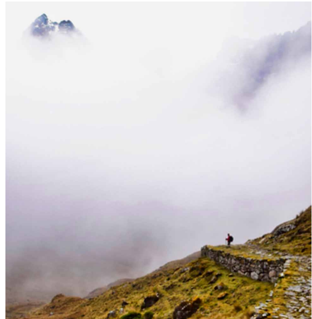
Adaptation to climate change requires navigating pathways toward unknown futures (photograph: trail in the Vilcabamba mountain range in the Peruvian Andes)

In these examples, new knowledge creates benefits for multiple stakeholders: mangrove restoration in Vietnam is desirable because it provides clear economic benefits