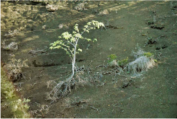
Restoration and adaptation strategies will increasingly come across novel ecosystems that enclose unknowns of their own (photograph: tree in the Galapagos Islands in Ecuador)

uses according to political and economic considerations and vested interests without considering local communities. However, governments and legislatures are the major agents that can incentivize land rights, tenure and access through policy reforms and legislation. Major challenges remain about how to balance top-down with bottom-up governance and how to resolve issues of tenure and access.