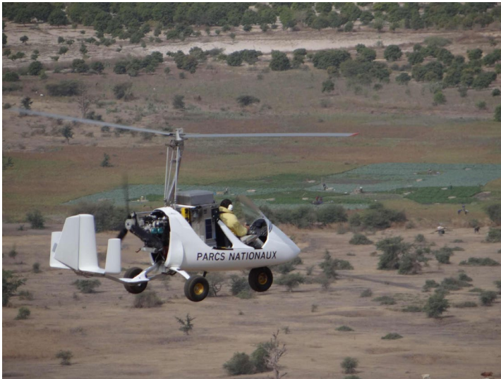
Figure 3. A gyrocopter releasing sterile tsetse male Glossina palpalis gambiensis in Senegal thanks to an automatic release machine.