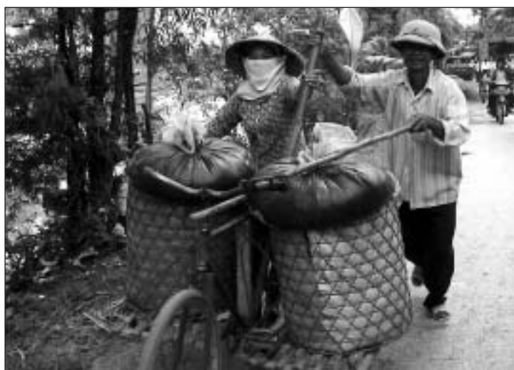
Figure 2: Transport of pig manure by vegetable producers

We have also tried to pinpoint farmers' preferences for one or another form of organic matter and the determining factors that convince them to choose organic fertilization or feed rather than chemical fertilization or industrial feed. We recount here the results of our surveys and thus it is farmers' opinions that we will try to bring to the fore. In general, pig manure is considered as being of better quality than organic matter from cattle or buffalo because industrial feeds are of high quality, whereas herbivores have a poor diet, usually grazing on the edges of paddy fields.