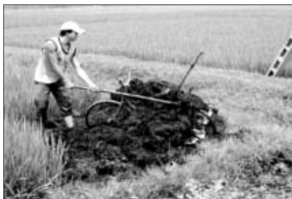
Figure 2: Characteristic of organic fertilizer

The quality of organic fertilizer depends on many factors such as on-farm practices and proportion of crop residues incorporate during the composting process. Moreover, solid waste management techniques and characteristics of crop residue mixed in pig manure also affect the quality of organic fertilizer. Difference of process in managing the pig waste among farmer households has given different types of organic fertilizers before applying for crops on the field.