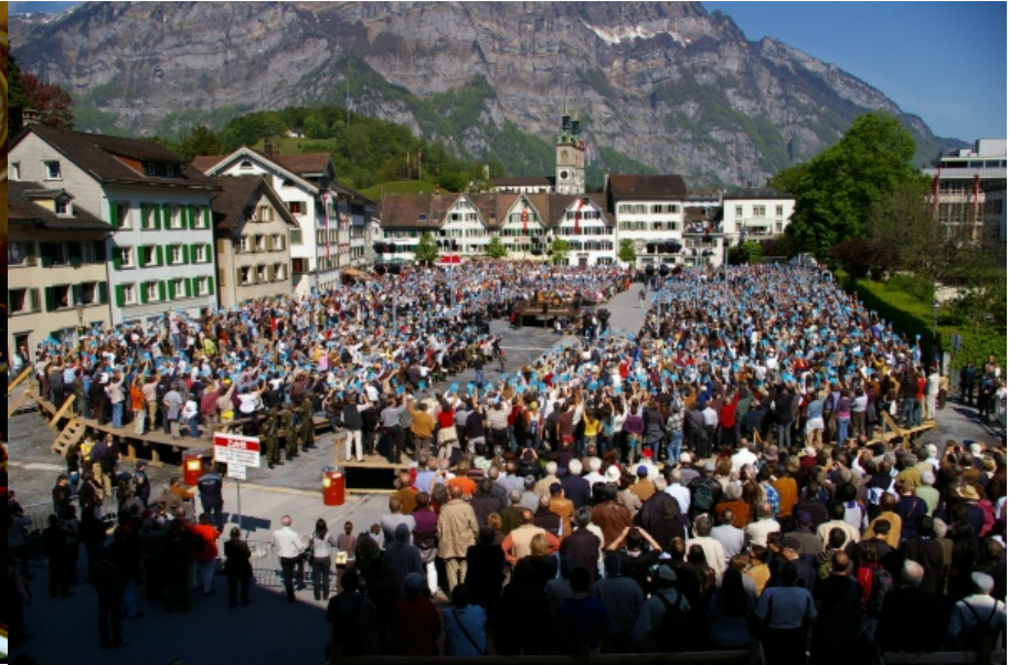
The UN General Assembly The Glarus Canton Assembly (CH)