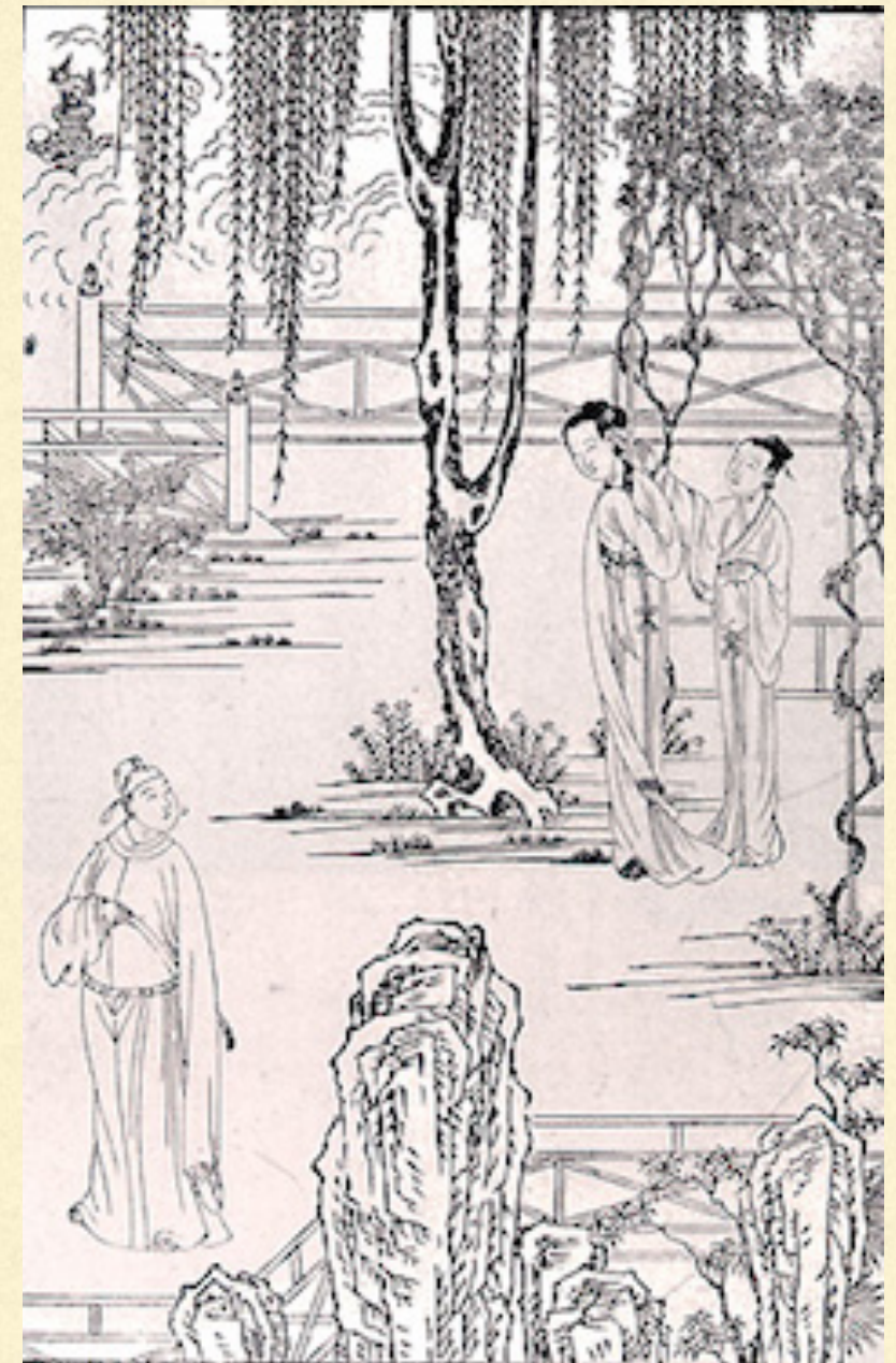
Print illustration of zaju plays by Yuan playwrights, a book of the Wanli period (1572–1620).